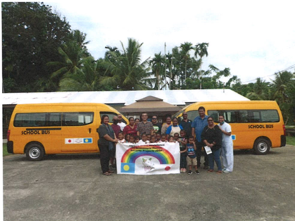
Handover Ceremony on November 04, 2020

The school buses were turned over to the Palau Community Action Agency on November 4, 2020 in a formal Handover Ceremony as shown below: