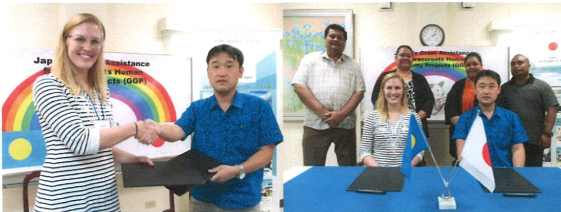
Signing of the Grant Contract on March 05, 2020

The Embassy of Japan in the Republic of Palau awarded the sum of $79,917.00 to Palau Community Action Agency for the procurement of School Buses pursuant to a Grant Contract executed between the Embassy of Japan and Palau Community Action Agency on March 05, 2020, as shown below: